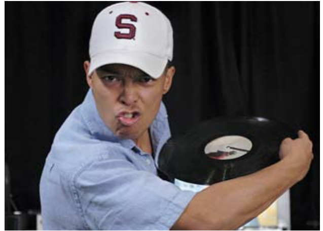
October 2009: COPYRIGHT CRIMINALS