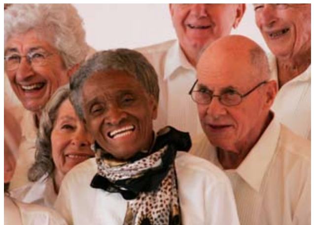
December 2009: YOUNG@HEART