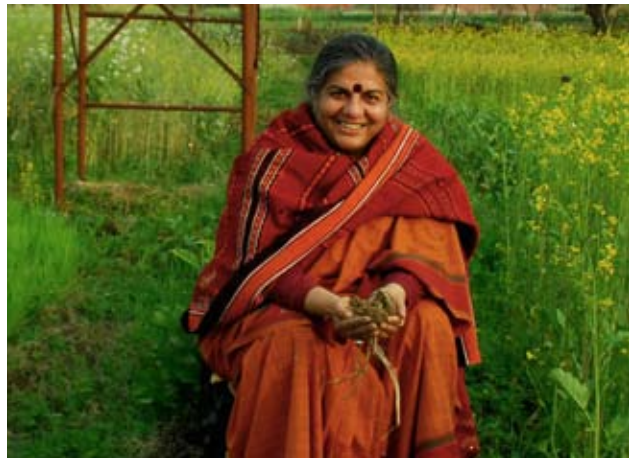
March 2010: DIRT! THE MOVIE